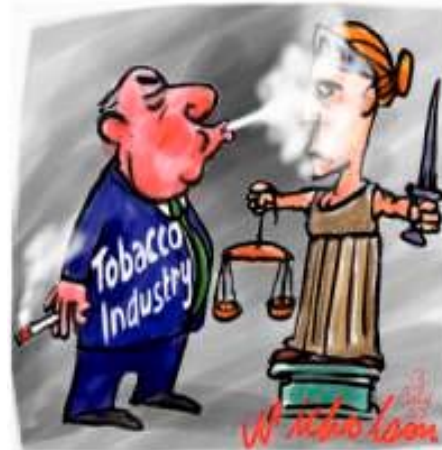
Tobacco Industry shreds evidence

Nicholson of "The Australian" newspaper: www.nicholsoncartoons.com.au