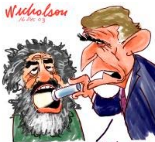
Those Weapons of Mass Destruction must be somewhere.