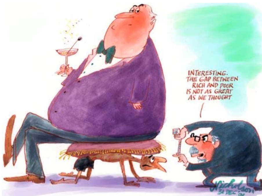
Nicholson of "The Australian" newspaper: www.nicholsoncartoons.com.au